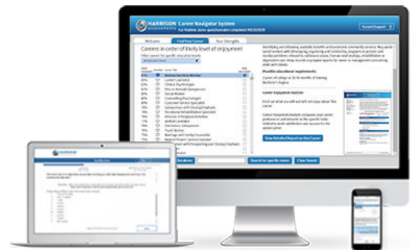
Online Interactive Career Portal